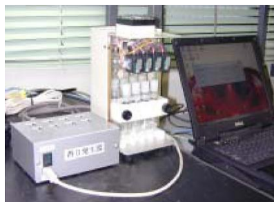
Fig Picture of perfume emitting device connected to a PC developed at Fukui National College of Technology

6.2 Development of a Perfume Emission System via Internet (J. Comput)